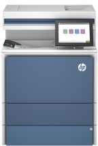
HP Color LaserJet Enterprise MFP X57945dn Printer

This printer is intended to work only with cartridges that have a new or reused HP chip, and it uses dynamic security measures to block cartridges using a non-HP chip. Periodic firmware updates will maintain the effectiveness of these measures and block cartridges that previously worked. A reused HP chip enables the use of reused, remanufactured, and refilled cartridges. More at: http://www.hp.com/learn/ds