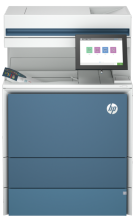
HP Color LaserJet Enterprise MFP X677dn Printer

This printer is intended to work only with cartridges that have a new or reused HP chip, and it uses dynamic security measures to block cartridges using a non-HP chip. Periodic firmware updates will maintain the effectiveness of these measures and block cartridges that previously worked. A reused HP chip enables the use of reused, remanufactured, and refilled cartridges. More at: http://www.hp.com/learn/ds