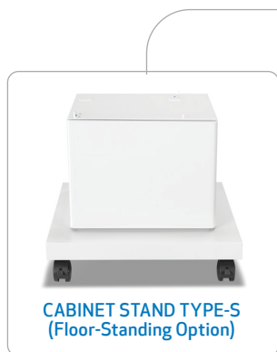
CABINET STAND TYPE-S (Floor-Standing Option)

Canon eCarePAK Canon Extended Service Plans offer coverage beyond the standard one-year limited warranty 6 up to four years.