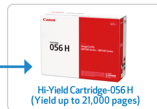
Hi-Yield Cartridge-056 H (Yield up to 21,000 pages)

Use of Canon GENUINE toner cartridges helps provide longer equipment life, high yields, reliable performance, high-quality output, and minimal jamming or issues.