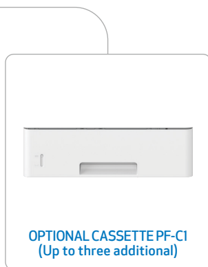
OPTIONAL CASSETTE PF-C1 (Up to three additional)